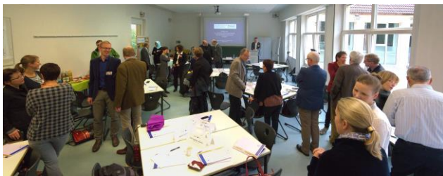
Researchers, teachers and multipliers talking about READY

Involvement in the READY project has been interesting indeed. Every project has its various phases, and we are moving from a period of learning and gathering data with an open mind, towards a period of analyzing the material and communicating what has been learnt. The national multiplier event in Tübingen was such an event. School teachers, teacher educators and researchers were present.