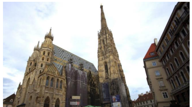
St. Stephen's Cathedral (Vienna) opposite our conference venue

To get a live impression of this new reality, we will explore the city of Vienna according to the motto "Vienna – Lived Diversity as Chance and Challenge", following trails of Protestant, Orthodox, Islamic and Jewish heritage and meet representatives from these religions and cultures. Of course, we will have plenty of time for conversation and exchange as well.