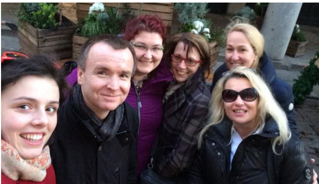
Austrian study group in London

From 20 th March to 24 th March, four student teachers and two course leaders from the KPH Vienna visited London to explore the English education system and how Religious Education/Religious Studies (RE/RS) is taught in England.