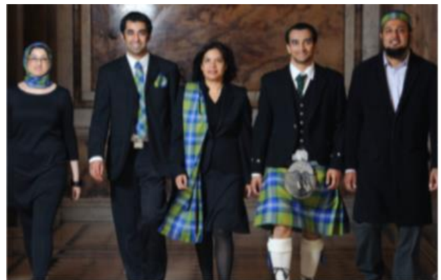
The Islamic Tartan

The lessons were part of a unit on Islam for S2 classes (ages 13-14).